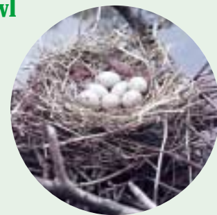
PCT: P&R Ltd

To help nesting ducks rear their broods successfully, encourage the development of areas of tall rushes and reeds growing in very shallow water where the young will be safe from predators like fox on the bank and pike underwater.