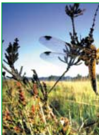
PCT: P&R Ltd

The first reason is that new ponds are a very distinctive habitat, used by plants and animals that are not found in more mature ponds. Usually these are species that either (a) prefer bare sediments or (b) do not compete well with others. This includes many annual water plants like celery-leaved buttercup as well as dragonflies such as the four-spotted chaser and common darter. Artificially maturing sites by adding plants hastens the end of the “new pond” stage and stops the pond from providing an important refuge for these species.