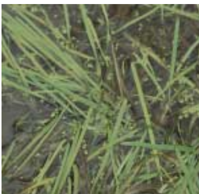
Small sweet-grass ( Glyceria fluitans )