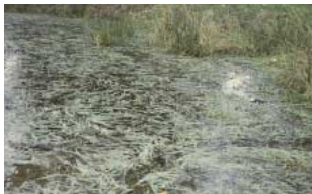
Floating grasses provide a valuable habitat for many species of aquatic invertebrate