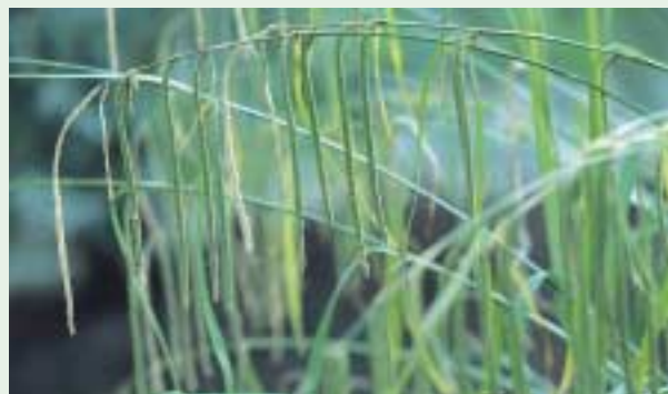
PCT: P&R Ltd