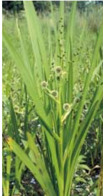
Branched Bur-reed ( Sparganium erectum )

Yellow Flag ( Iris pseudacorus ) is attractive, but has very tight, rigid leaves, and likes its feet to be above water in summer. It does not, therefore, provide an ideal aquatic habitat although its aerial leaves and flowers are used by a range of terrestrial insects.