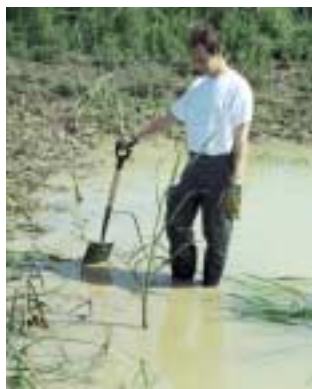
Planting emergent plants

The most difficult pond plants to establish are usually the submerged species - and because these can be fussy, many introductions fail. The best way of encouraging them is to make sure that the pond has good water quality and to only add plants from near-by sites likely to have a similar water type. The good news is that, without planting, aquatic plants will usually arrive naturally at a pond within 1 - 2 years. If not, do not worry: it is a myth that submerged plants are vital in ponds to provide oxygen. Unlike streams and rivers, ponds have naturally low or variable oxygen levels, to which pond animals are perfectly well adapted. Submerged plants can, undoubtedly, provide a useful habitat for animals in the otherwise dangerous deep open water areas of a pond. But the pond edges are a much more important area for most animal species and most conservation gains can be made by ensuring that these edge areas are rich in marginal plants that have a good underwater structure.