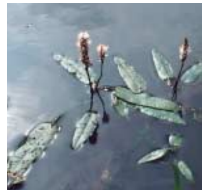
Amphibious bistort ( Polygonum amphibium )

Two other native species, White Water-lily ( Nymphaea alba ) and Yellow Water-lily ( Nuphar lutea ), are also often planted in ponds. These species would, however, usually be associated with ponds in floodplains or extensive wetlands, so could be considered inappropriate for ponds in other locations.